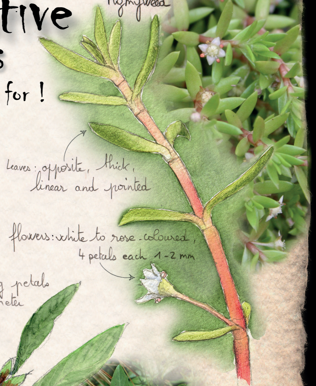
New Zealand Pigmyweed

Leaves: opposite, thick, linear and pointed